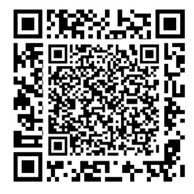
Registration QR Code to scan

For more information contact: (336) 922-4073 or wschoralacademy@gmail.com www.wschoralacademy.org